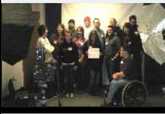
Rushing Wind Street Ministries fixing supper